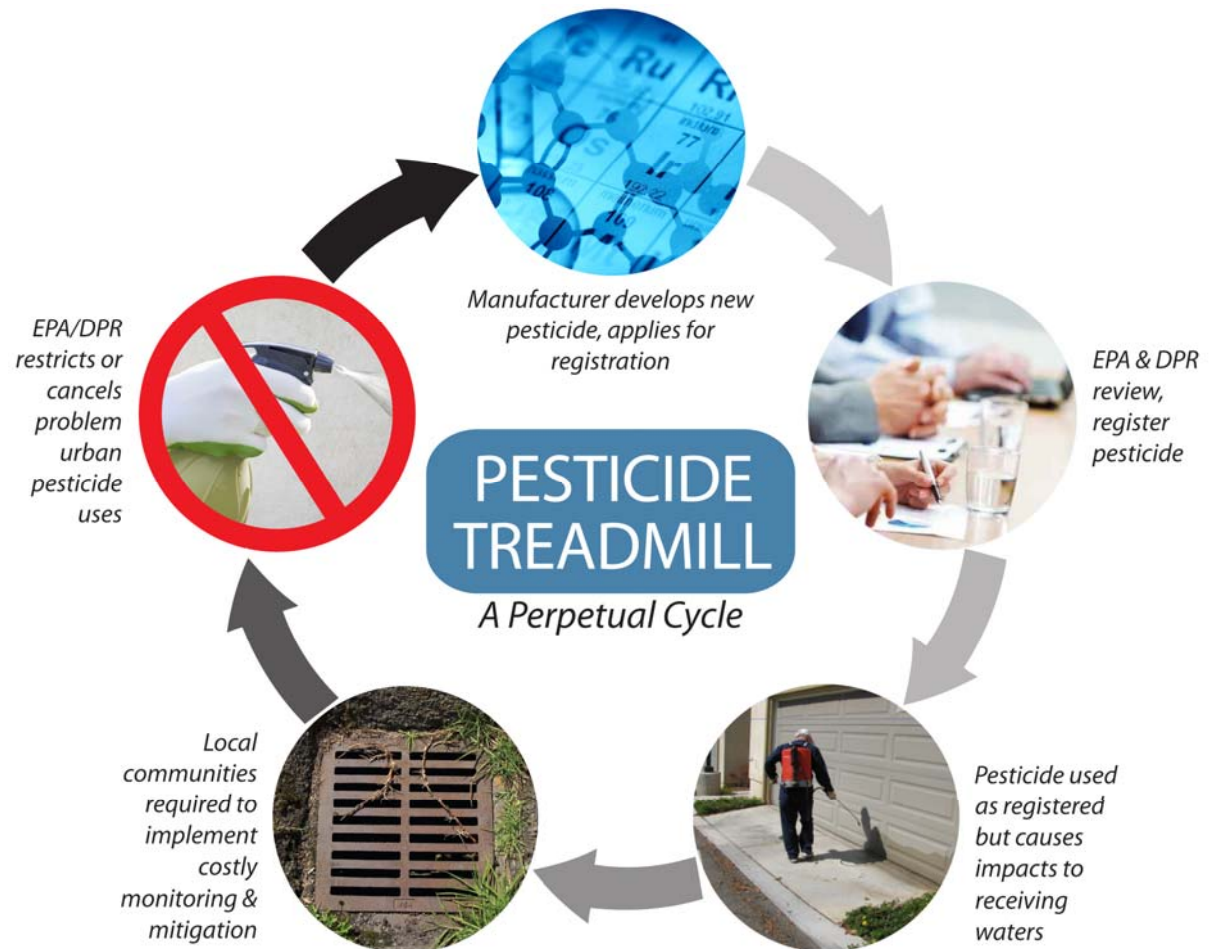
Figure 1. Our current pesticide regulator system does not adequately protect urban waterways.

For years, CASQA members have creatively tried to work around their lack of regulatory authority over pesticide use by pioneering award-winning public outreach and integrated pest management programs that encourage less-toxic alternatives. Local agencies also conduct collection events for banned pesticide products at their own cost. These “source control” efforts have established an extremely important and growing movement toward less-toxic alternatives; however, these activities fail to compensate sufficiently for the root problem: as currently implemented, pesticide regulatory actions at the state and federal levels do not adequately account for and mitigate potential water quality impacts from urban pesticide uses. With each new urban pesticide problem, local agencies face the potential of greater monitoring and source control requirements, neither of which promises to reduce pesticide-related toxicity locally or statewide.