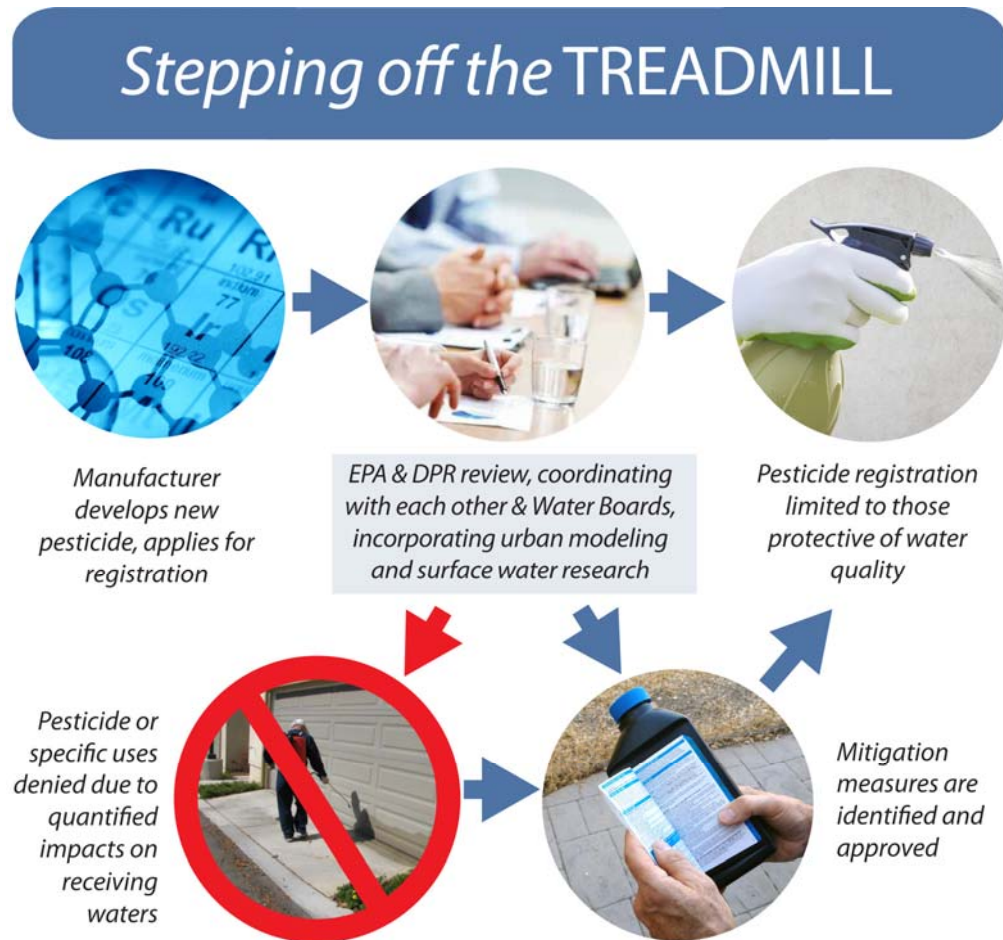
Figure 4. CASQA envisions an effective regulatory system to identify whether urban uses of a pesticide pose a threat to water quality and then restrict or disallow those uses proactively so that water quality impacts are avoided.