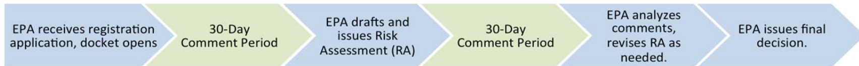
Figure 2. EPA’s New Pesticide Registration Process

Immediate pesticide concerns may arise from regulatory processes undertaken at DPR or EPA. For example, when EPA receives an application to register a new pesticide, there may be two opportunities for public comment that are noticed in the Federal Register, as depicted in green in Figure 2 (below). EPA’s process usually takes less than a year while DPR typically evaluates new pesticides or major new uses of active ingredients within 120 days. While EPA must consider water quality in all of its pesticide registration decisions, numerous pesticide registration applications are not routed by DPR for surface water review (see sidebar)